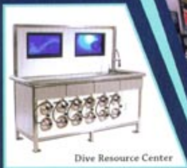
Dive Resource Center